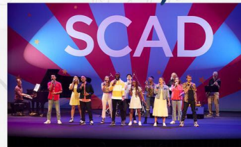
SCAD Bee Sharps

For more information visit exploremitchelville.org or call 843-255-7301.