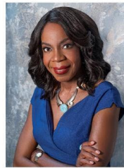
Dr. Edda Fields-Black Author of COMBEE: Harriet Tubman, the Combahee River Raid, and Black Freedom during the Civil War